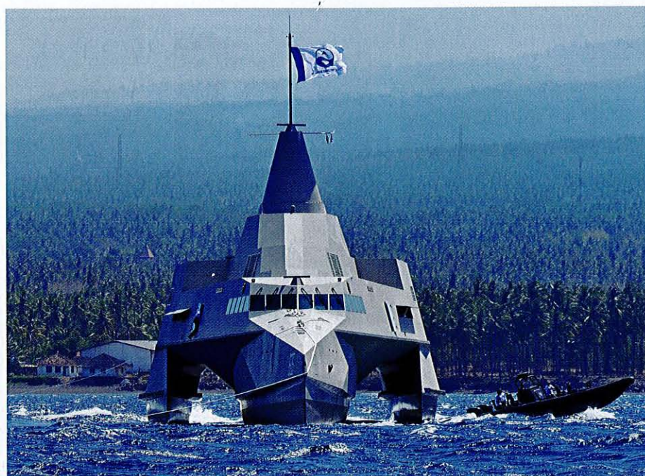
Fig. 4: Measuring 63m in overall length, the Indonesian Navy's newest surface ship, the trimaran KRI "Klewang" built by North Sea Boats Ltd., was launched on 31 August 2012.

construction expected to be underway by 2018. A foreign design will likely be acquired and built in a domestic yard. Ship-to-shore connector requirements for the "Makassar" class LPDs, and the increased size of the TNI-AL Marine Corps call attention to replacements for 54 aging utility landing craft (LCU).