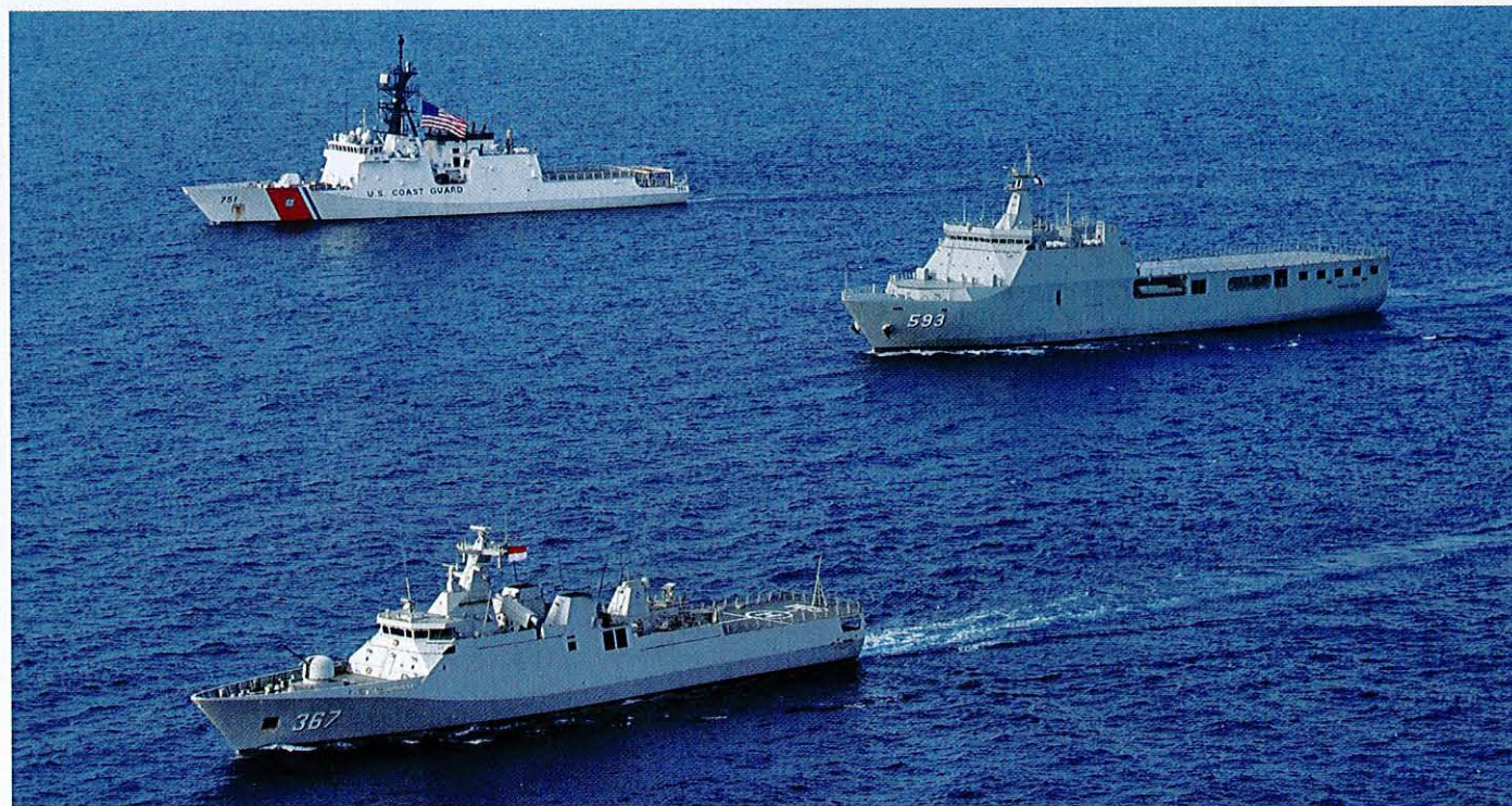
Fig. 3: The Indonesian Navy's SIGMA corvette KRI "Sultan Iskandar Muda" and the "Makassar" class LPD KRI "Banda Aceh" seen here during ship formation exercises with the US Coast Guard in the Java Sea.

The TNI-AL also has a requirement for a modern force of medium landing ships (LSM) to provide support for ground force and cargo movements throughout coastal area and islands. The sea service is expected to begin a domestic LSM replacement programme for its 12 former East German FROSCHE-I by 2014, with